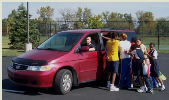
Everybody pile in!

would contribute just $50 toward the bus’s purchase, we would be halfway there. Please consider assisting with our bus fund in addition to your regular support of Heritage Mission.